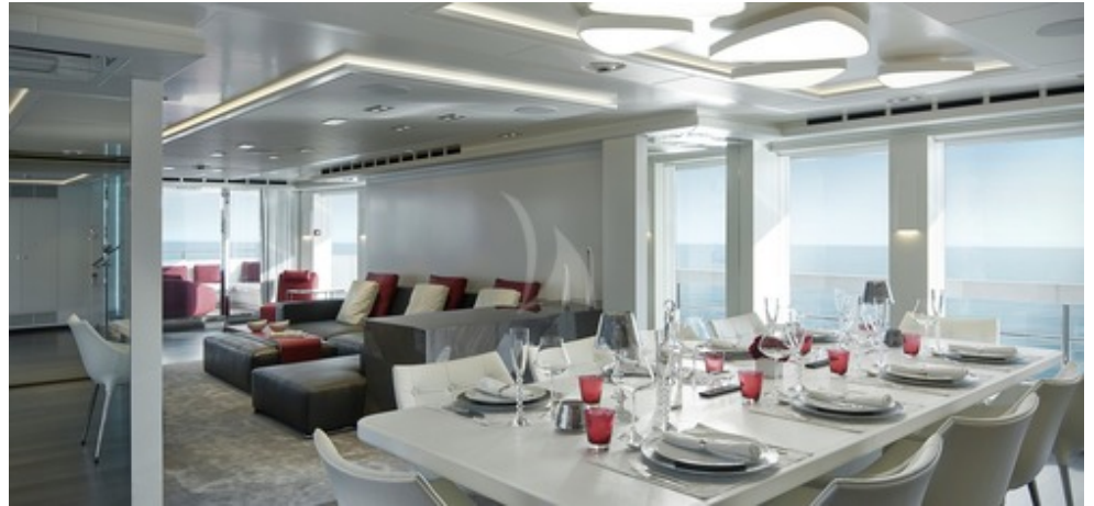
Main deck dining and lounge