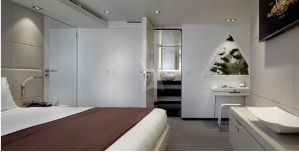
Double guest cabin