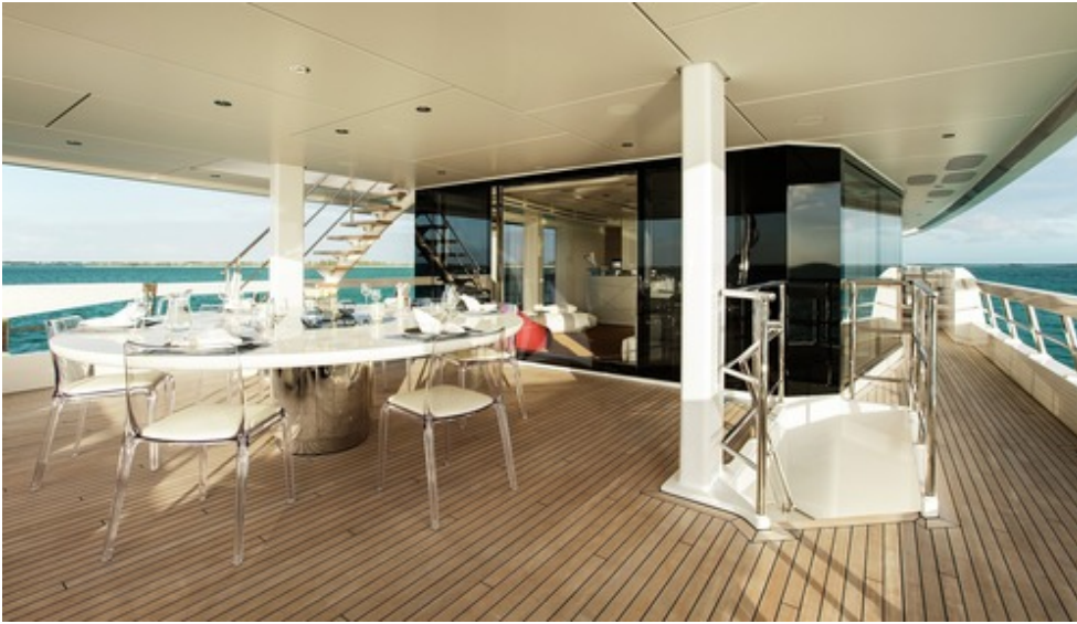
Bridge deck dining