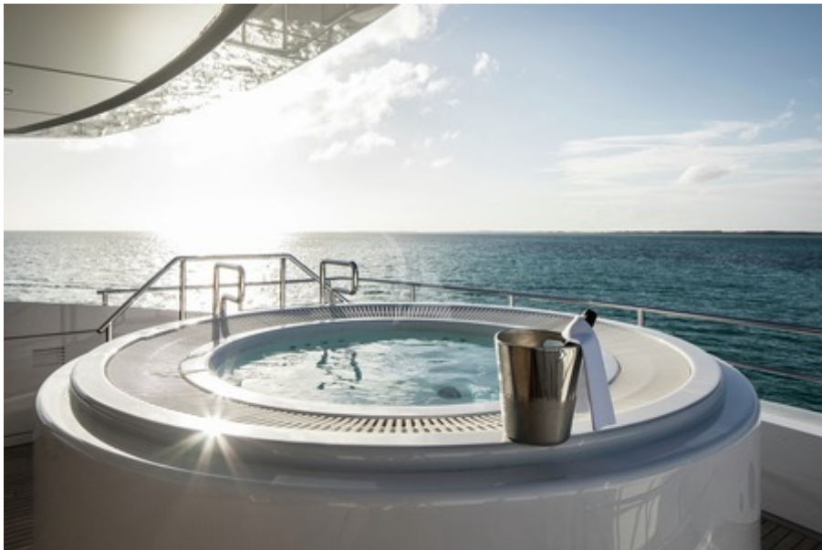
Sun deck jacuzzi