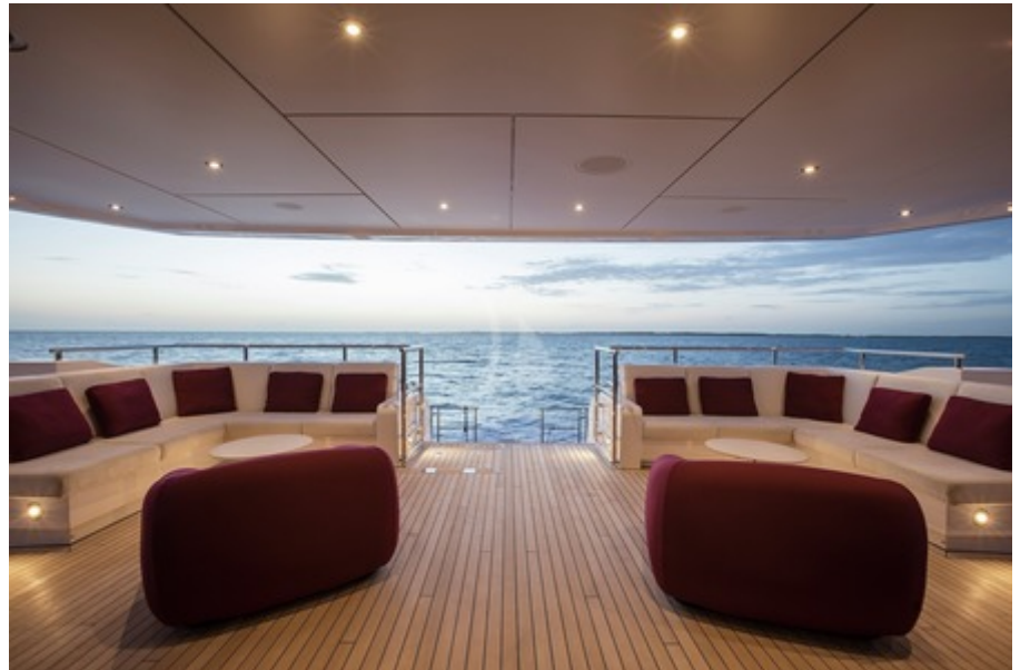
Main deck aft